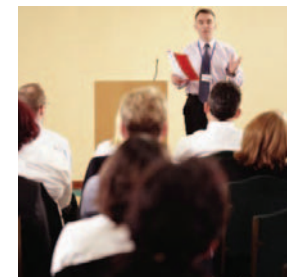
When there is an emerging issue, we'll see it before anyone else and have the data to back it up.