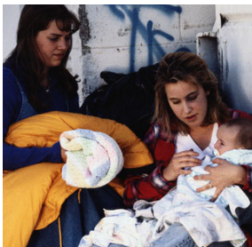
Most-frequent requests are for rent, mortgage and utilities, food, health care, and transitional housing for families.