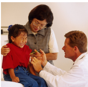
2-1-1 helps people access a wide range of services—24 hours a day, every day of the year.