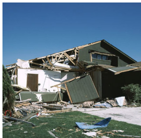
Inquiries about emergency services deployed after a national disaster can be answered promptly to reassure those in need.