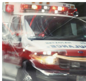
More than 60,000 calls per year would be diverted from 9-1-1 to 2-1-1, freeing 9-1-1 dispatchers to respond to police, fire, and medical emergencies.

2-1-1 is answered 24/7 by people trained to assess callers' needs quickly and refer them to the most appropriate assistance.