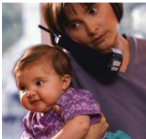
Studies show people typically make seven to eight calls before reaching the service organization they need.