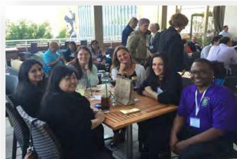
The Center hosted our launch party at the National Community Schools Forum in New Mexico, seen here celebrating with local and national partners in April 2016.