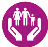
WHOLE CHILD SUPPORTS